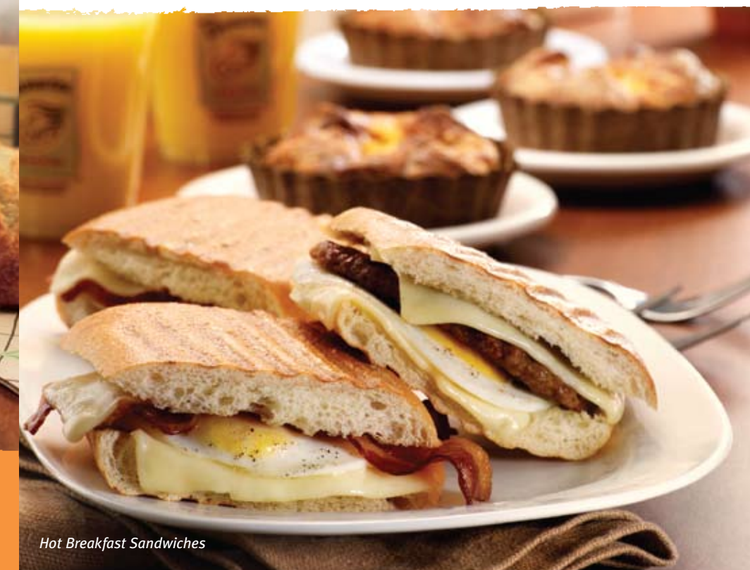
Hot Breakfast Sandwiches