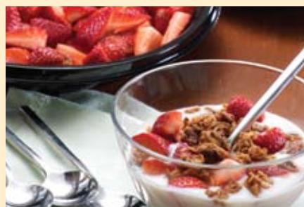
Strawberry Granola Parfait