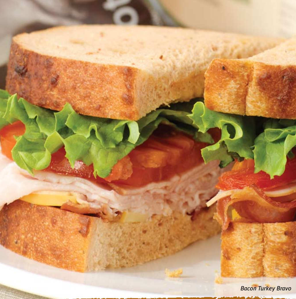
Bacon Turkey Bravo